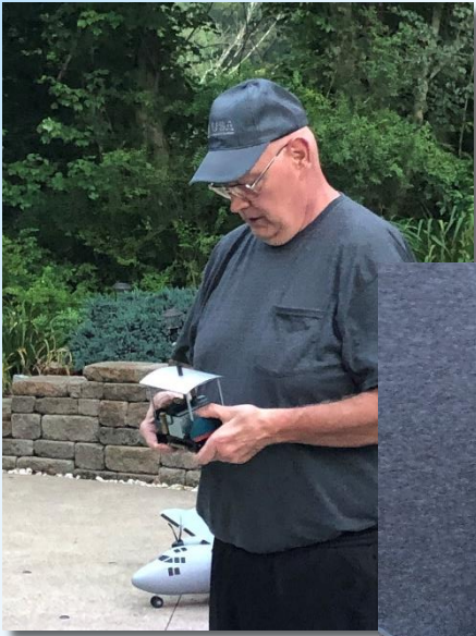
Tom Carvel's handmade garden scale locomotive.