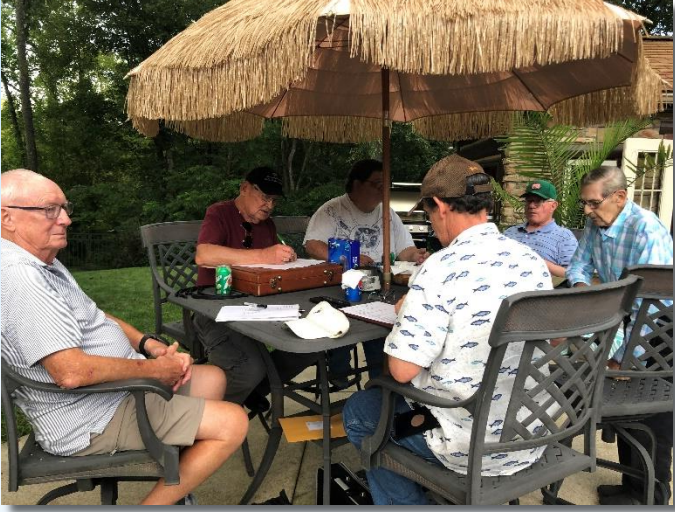
Some of the attendees..